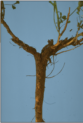
Weak crown, less symmetry, fewer shoots.