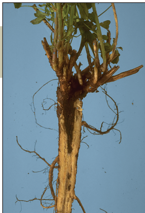
Root rot affects more than 50% of the root's diameter, significant vascular discoloration. Not likely to survive winter.