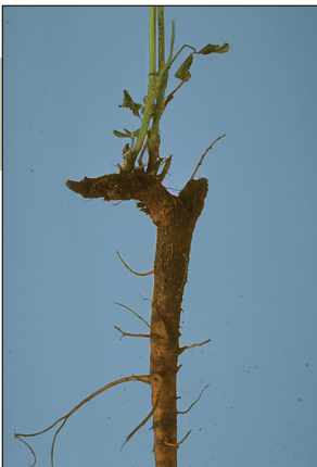
Complete lack of symmetry, few shoots.