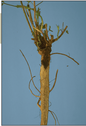
Significant crown rot and root discoloration. Good survival in mild winters; poor survival in hard winters.